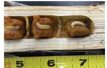
Carpenter Bee larvae on bee bread in brood cells within a yucca stalk.

Unlike the highly social honey bees whose labors support the entire colony, most native bees (>75%) are solitary. Each female bee is a hard-working single mom who needs food and shelter for her brood. She mates, selects a site for a nest, and constructs brood cells. Over countless forays, she gathers pollen, nectar, and occasionally floral oils, until she amasses enough to provision a youngster to adulthood. She kneads them together, along with her anti-microbial saliva, into a ball of bee bread, then lays a single egg on top. She seals the brood cell shut, repeating the process for additional young. Inside, the larvae grow, pupate, and metamorphose into adults, then emerge to continue the cycle.