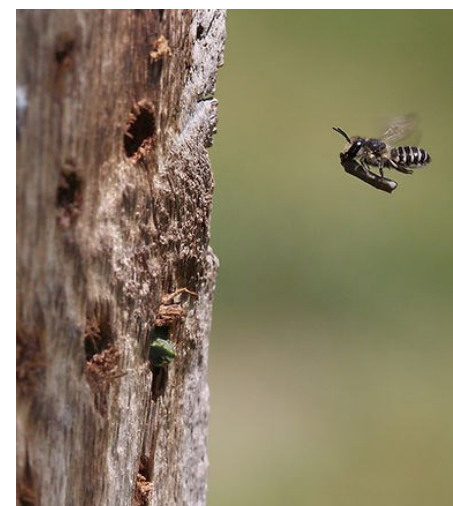
Leaf cutter bee using holes drilled in wood for bee houses.