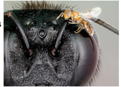
Fairy Bee superimposed on the head of a Carpenter Bee.

Most of us are familiar with honey bees, which came to North America with European settlers in the 1600s. Some escaped domestication, and feral colonies exist all over the Americas today. However, a diverse array of native bees have lived here far longer, adapting to regional ecological conditions. They range from the tiny, rusty Fairy Bee ( Perdita minima ), at <.08 inches/2 mm, to the large, shiny, black Carpenter Bee ( Xylocopa sp. ) at ~1 inch/20 mm in length. Like honey bees, they collect flower nectar and pollen to eat and feed their young, but do not use them to create stores of honey.