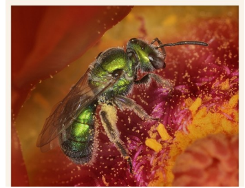
Sweat bee.

Sweat bees ( Augochlorella sp.) can be “primitively social” – they overwinter as fertilized females, emerge, provision a nest and lay mostly female eggs. The adult daughters take over provisioning while the foundress remains as queen. She may lay up to three generations of eggs before dying. Females of the final brood mate and start their own nests the following year.