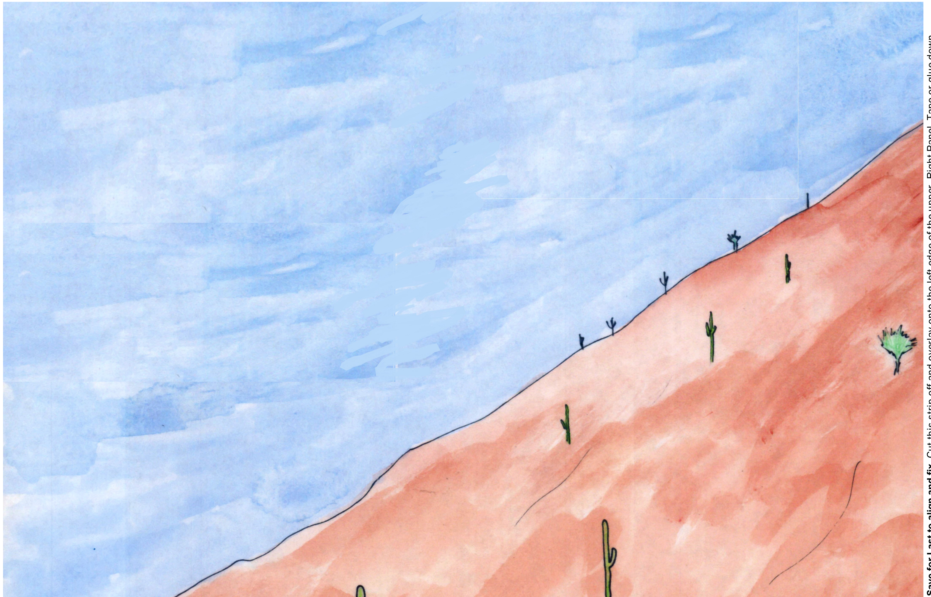
Game Board Upper Left Panel. Keep this strip and align the cacti and mountain edges from the Lower Left Panel's and Upper Right Panel's borders. Save for last to glue or tape down once aligned.

Save for last to align and fix. Cut this strip off and overlay onto the left edge of the upper Right Panel. Tape or glue down.