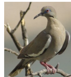
White- winged Dove