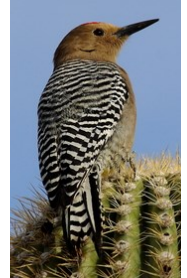
Gila Wood- pecker