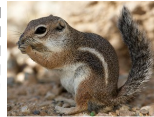
Harris' Antelope Ground Squirrel