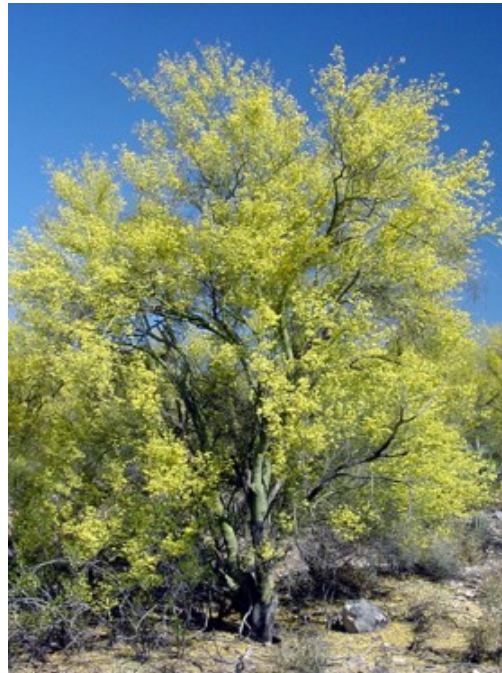
Palo Verde Tree