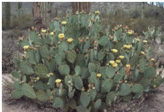
Prickly Pear Cactus