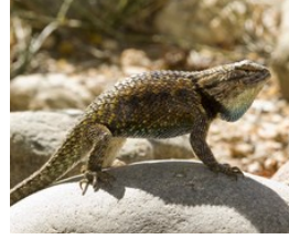
Desert Spiny Lizard