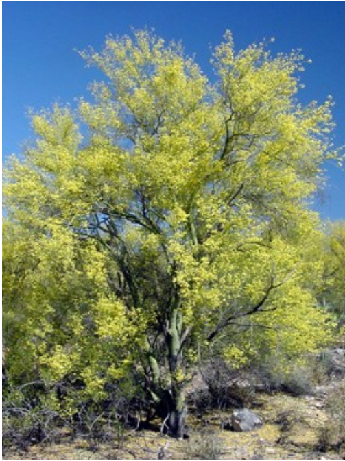
Palo Verde Tree